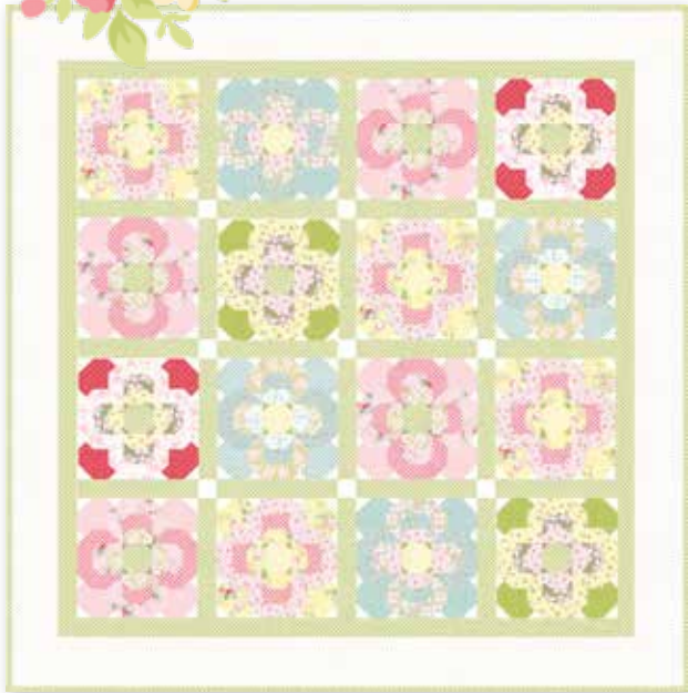
AQ 264/AQ 264G Vintage Posies 86"x86"